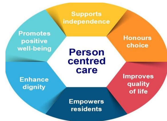
Figure 1: Person centered care.

patient rights, can take various forms and is not solely confined to religious or specialized interventions by priests, chaplains, or spiritual specialists. Instead, it can also be facilitated through compassion and attentive listening, extending to involvement from staff or the patient's loved ones [9]. Saunders stressed the necessity for all involved in caring for the seriously ill and dying to understand their roles, making spiritual care the collective responsibility of everyone involved in the care of residents. Qualifications and knowledge were emphasized as pivotal for providing a holistic approach, with spiritual care at its core [10] (Figure 1).